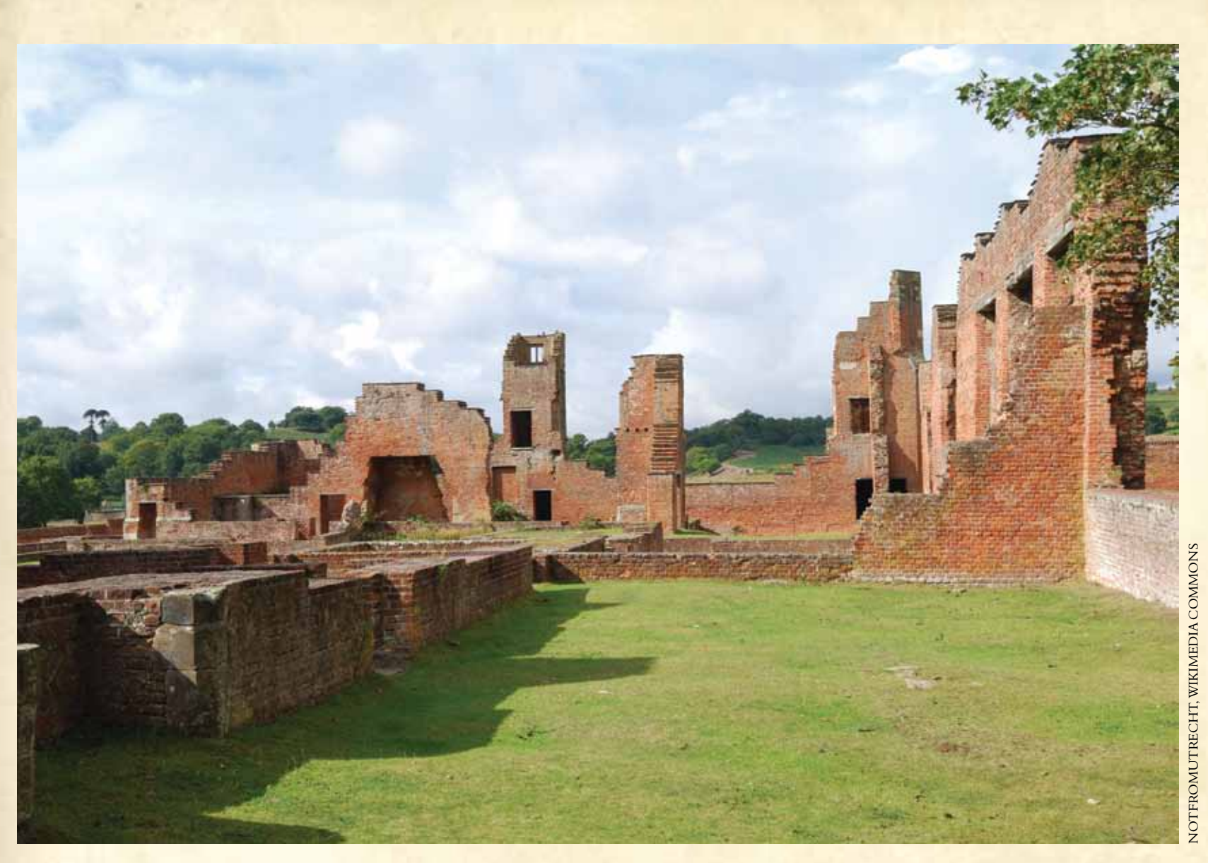
The ruins of Bradgate House, where Jane used to live.