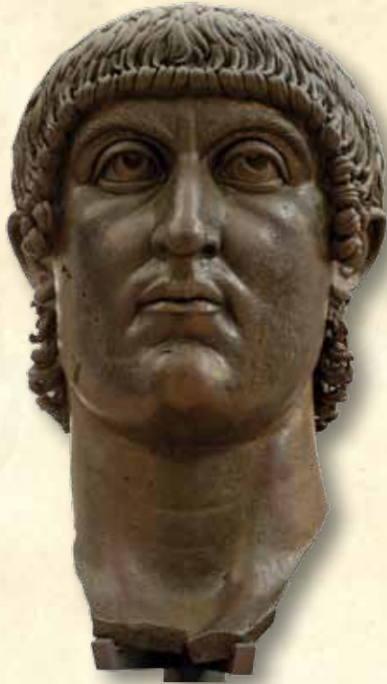
Constantine, Roman emperor from 306 to 337