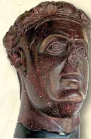
Galerius, emperor of the Eastern Roman Empire from 305 to 311