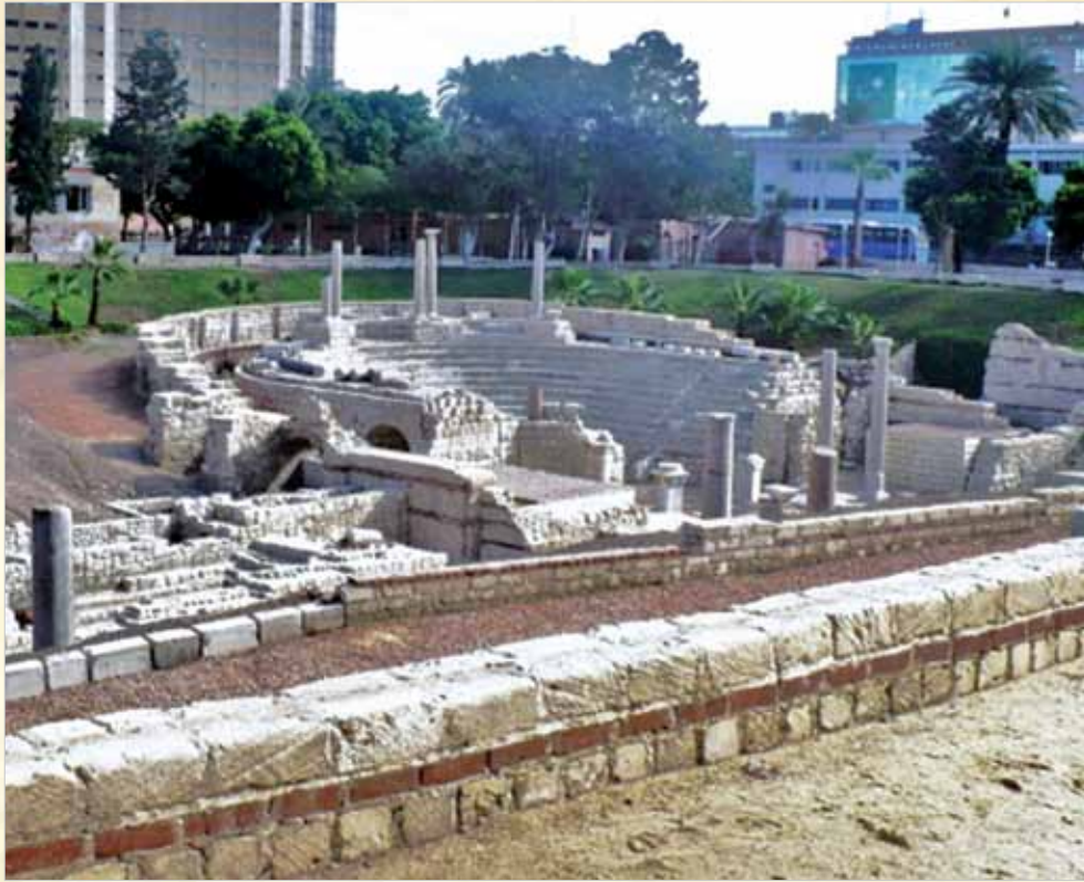
Roman theater in Alexandria, where gladiatorial games and chariot races were held. During the Roman persecutions, Christians were often killed in these open theaters.

Alexandria was a large city and a good place to study. It had some of the best schools and, at one time, the largest library in the world. It was also a rich city with two large harbors, sending goods to other parts of the Roman Empire and other lands like India, China, and Arabia. The church there, however, was facing many problems. A priest named Arius was causing some serious problems. He was teaching some things that Alexander considered very dangerous.