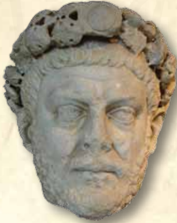
Diocletian, emperor of the Eastern Roman Empire from 284 to 305