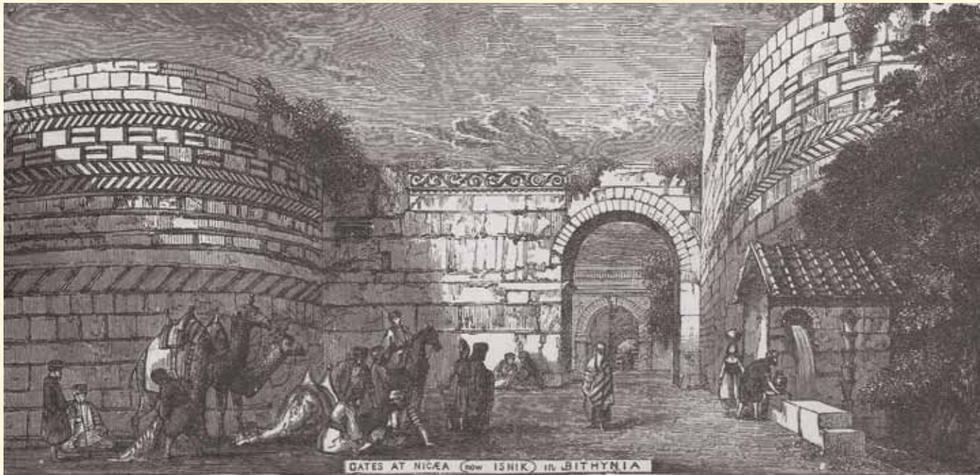
A portion of the ancient walls of Nicea, as seen by a nineteenth-century artist.

Emperor Constantine was worried because these disagreements often turned into fights. In the year 325, after he had become emperor of the whole Roman Empire, both in the East and in the West, he called all Christian bishops to a meeting in the town of Nicea (pronounced NĪ-SEE-ah), in the area that is now called Turkey. It was a strange sight. Until then, many emperors had been enemies of Christianity, but now, for the first time, an emperor led a meeting of Christian leaders, treating them as important guests.