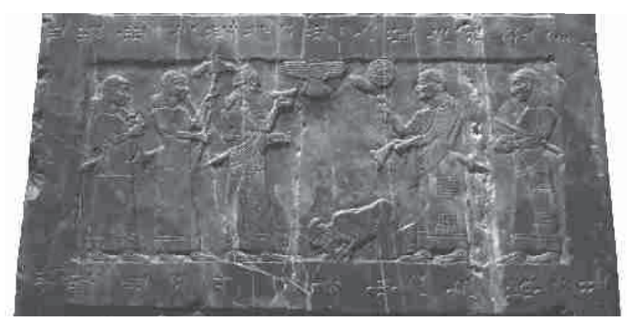
Figure 1.2. A first-millennium-BC Neo-Assyrian image of homage

envision a day when all kings and nations will prostrate themselves before YHWH. Indeed, poets even speak of heavenly creatures as worshiping before him (Pss. 29:1–2; 97:7). Note especially Nehemiah 9:6: