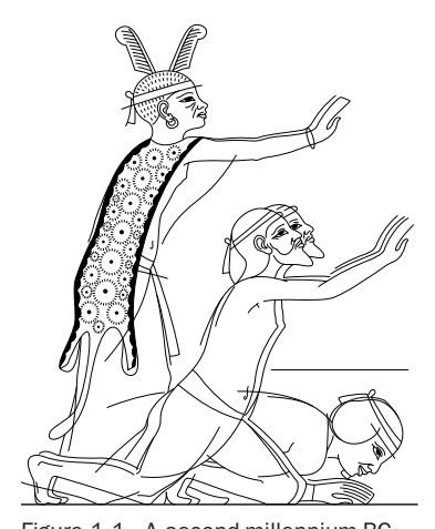
Figure 1.1. A second-millennium-BC Egyptian image of homage on lime-stone from the necropolis at Thebes (From Adolf Erman, Agypten und ägyptisches Leben im Altertun, edited by H. Ranke [Tübingen: Mohr (Siebeck), 1931, 477, figure 188, attributed ultimately to Achille-Constant-Théodore-Emile Prisse D'Avennes, Histoire de Tart Égyptien d'après les monuments depuis les temps les plus reculés jusqu'à la domination romaine [Paris: A. Bertrand, 1878], Dessin #3.)

The prostration expressed by hištaḥāwâ and other similar words was not limited to the worship of the Deity. In the ancient world and many cultures