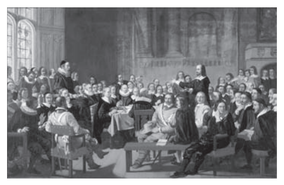
Assertion of Liberty of Conscience by the Independents in the Westminster Assembly of Divines (painting by J. R. Herbert, ca. 1844)

man a certain benefit, which was based on a certain condition. Man accepted this condition. Like Ursinus, Rollock referred to the initial covenant as a covenant of nature or works and the subsequent covenant as a covenant of grace. The context of the first covenant was the good, holy, and unimpaired nature received by man in creation. The condition of the covenant of works consisted of good works proceeding from the good, holy, and unimpaired nature of man. This condition had nothing to do with faith in Christ, nor with the works of grace and regeneration. After the fall into sin, the covenant of grace persuaded people to seek refuge in the covenant of grace. This covenant was based on satisfaction obtained through Christ; atonement was achieved through the establishment of a new covenant with man. In the covenant of grace, God promised justification and eternal life on condition of faith in Christ the Mediator. Man accepted this requirement to believe. In this context, reference was made to a condition of the covenant of grace; at this point, it was obvious that this condition was entirely based on the grace of God. Thus, justification was incorporated into the doctrine of the covenant. The Westminster Assembly further elaborated this initial formulation.