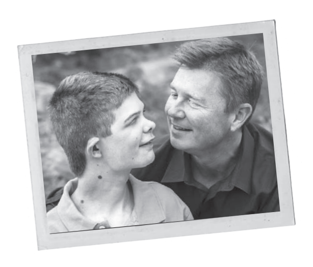
A Father's Courage