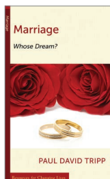
Marriage, 978-0-87552-675-1, $3.99