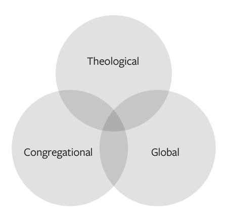
Figure 1 Dimensions of Faith Formation

The book is divided into three parts. Part 1 focuses on the theological dimensions of faith formation . Chapter 1 defines and traces the meaning of faith through the Old and New Testaments. Chapter 2 reviews faith formation from the perspectives of the major movements in Christian tradition.