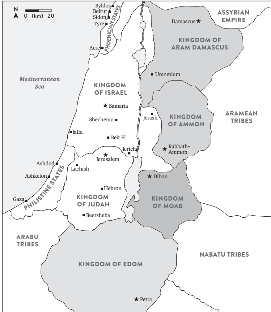
Map of Israel and neighbors

Use the first four columns of the oracles of judgment chart to answer the remaining questions.